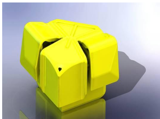
Corner clips 4 or 8 pcs / box

The clips are made of black PA 6.6 of industrial quality. They can be re-used several times and are adapted for 9 mm board material, with a tolerance of 8.5 – 10 mm.